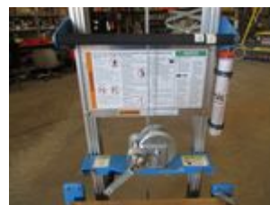
Fully Extended Equipment