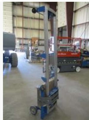
Engine Tray/Battery Pack