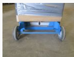
Platform/Carriage & Forks