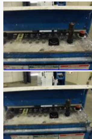
Platform/Carriage & Forks